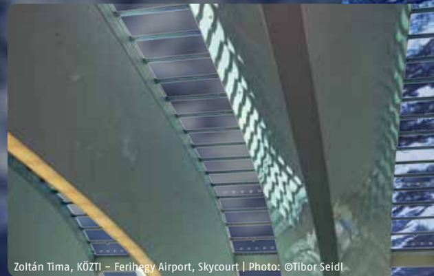
Zoltán Tima, KÖZTI - Ferihegy Airport, Skycourt