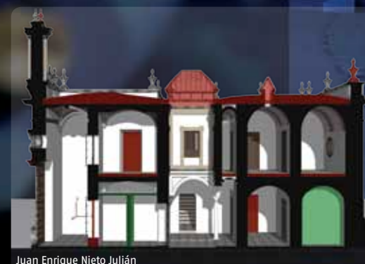
Juan Enrique Nieto Julián Royal Seville tobacco factory

With the evolution of building technology, renovation and refurbishment projects are nearly equal to the volume of new developments in many parts of the world. ArchiCAD 15 expands the design scope to renovation and refurbishment projects with native BIM design and documentation workflow support all the way through. Element Level Renovation Statuses for existing, new, and to-bedemolished structures, pre-configured renovation plan types that follow local CAD standards, and Powerful Customization Options, let architects create their own renovation plan types or styles using custom renovation "filters."